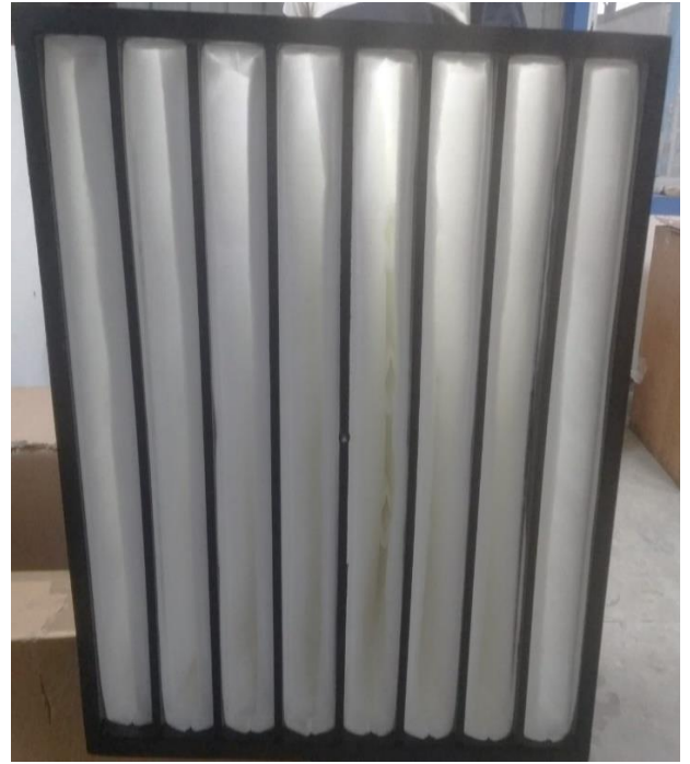
Figure-A: 1 st Stage Filter