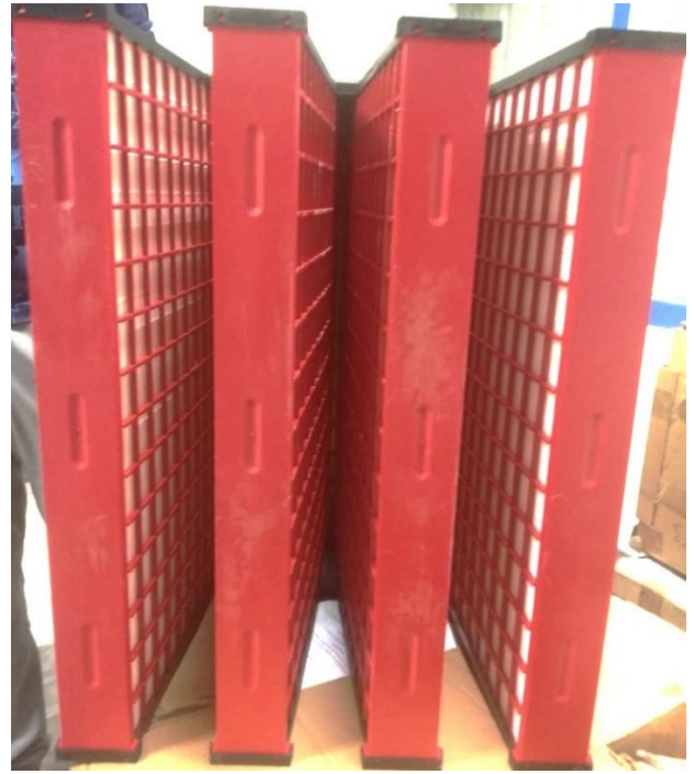
Figure-B: 2 nd Stage Filter